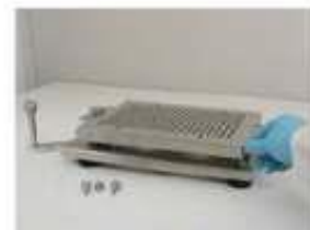
3. Unscrew 4 thumbscrews from corners of Filler Base.