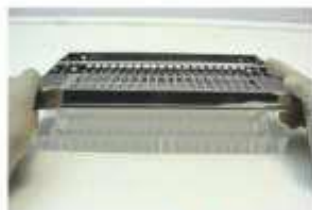
1. Lift out Orienter Tray.

ProFiller 3600 system's patented design requires no tools or adjustments to change capsule size.