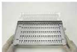
2. Slide new Orienter Tray in place.