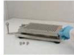
7. Secure with four thumb screws.