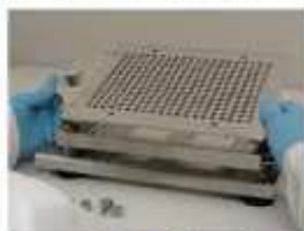
4. Remove Body Sheet Set.