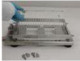
5. Switch Spacer Plate.